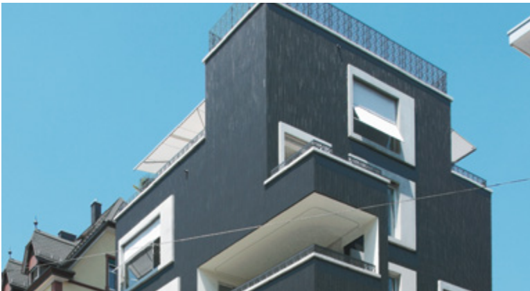
StoVentec C with ceramics

Architectural firm: I/AA Architects & Engineers, Enschede, Netherlands