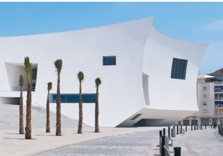
Auditorium and congresses, "Infanta Doña Elena", Aguilas /Spain Architectural firm: Barozzi Veiga, Barcelona

However severe the damage to the substrate, a solution is at hand: The adaptable sub-construction permits variable spacing between wall and render carrier board. This levels out unevenness and provides for rendition of the surface as detailed and drawn, however extreme the irregularities involved. Sub-construction problems are virtually unheard of, even on moist, cracked walls or unstable old plaster.