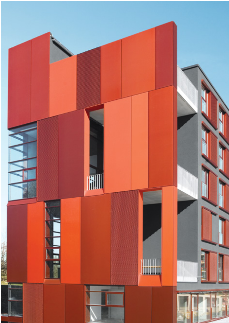
Student Housing, München, Germany Architectural firm: Spengler + Wischolak, Hamburg, Germany

At a glance: One system – a host of advantages.