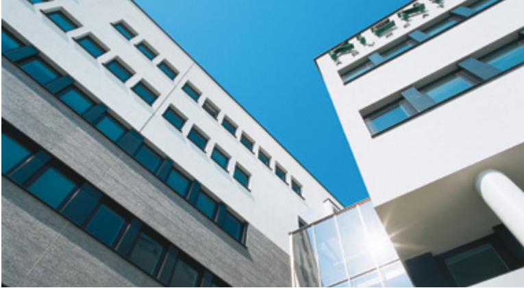
StoVentec S with natural stone

Office building Drienerbeek, Enschede, Netherlands